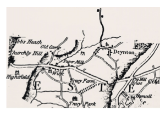
Fig 2.1 Doynton Map 1792

'If we say we have no sin we deceive ourselves'